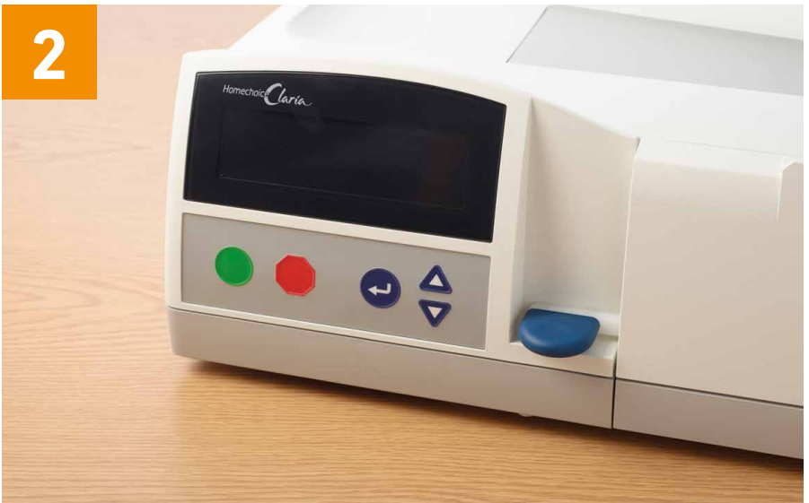
Machine must be off